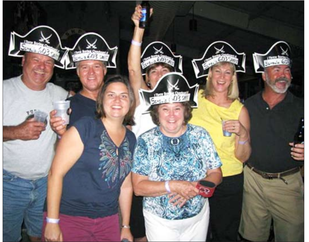
Samsula Lodge 603 members enjoyed Slovenefest weekend at the SNPJ Recreation Center.