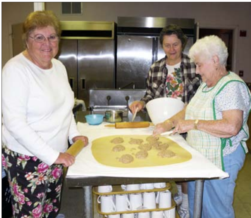
Whether they were rolling dough or spreading the filling, everyone had a job to do at the Lodge 778 potica making session.

The next Lodge 778 meeting will be held Sunday, Feb. 1, beginning at 1 p.m. As always, everyone is welcome. We encourage you to attend; you won't be disappointed!