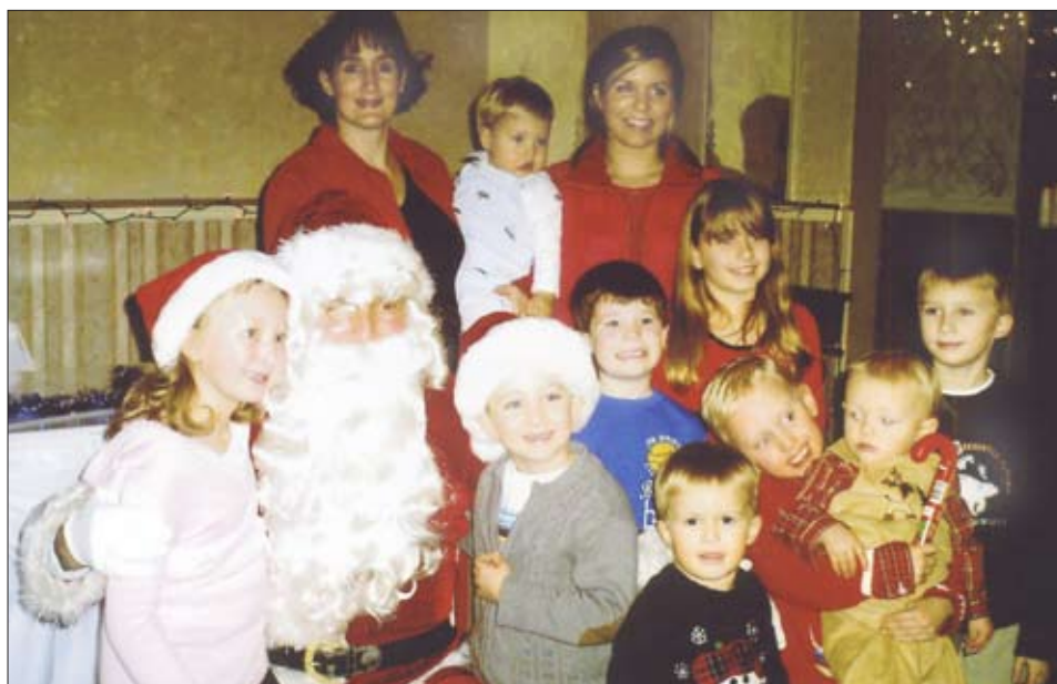
Members and guests of Reveliers Lodge 33 and Excelsiors Lodge 721 joined together to celebrate the season Dec. 7.