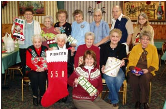
Lodge 559 members participated in a gift exchange at their Dec. 12 Christmas party at Czech Plaza Restaurant.

Many people in our area are awaiting the warmer temperatures. It's getting depressing for many. Otto and I continue our regular routine, but for us, spring can't be far away.