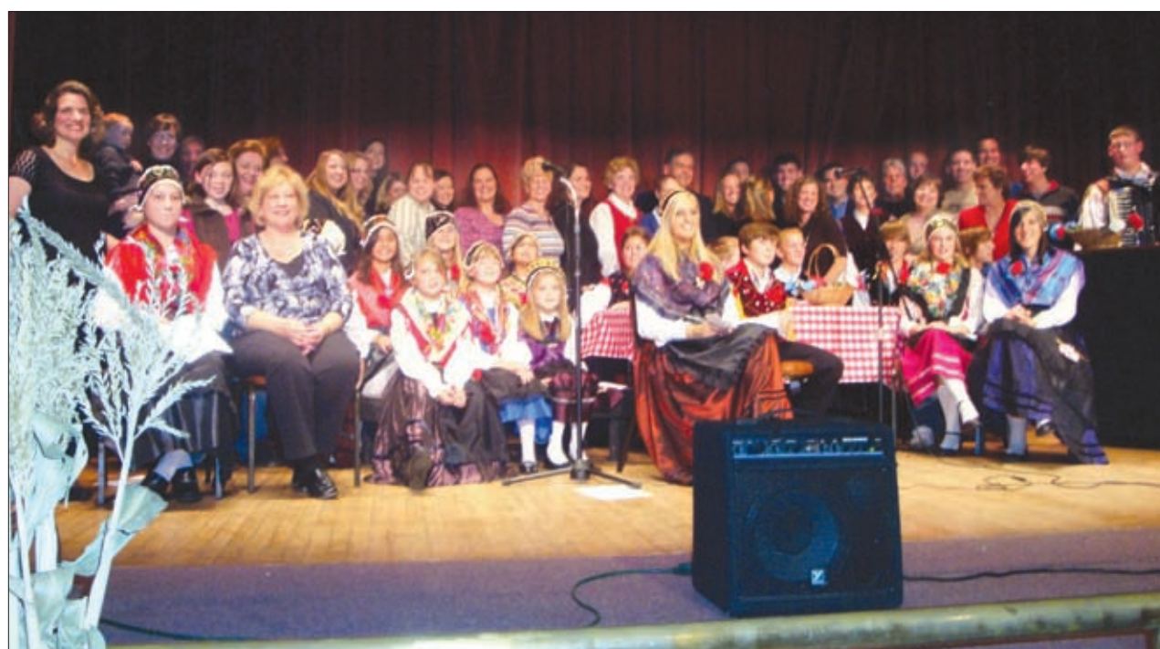
SNPJ Youth Circle 2 Slovenian Junior Chorus members and alumni gathered together on stage during the annual Fall Concert to celebrate the Circle's 70th anniversary.