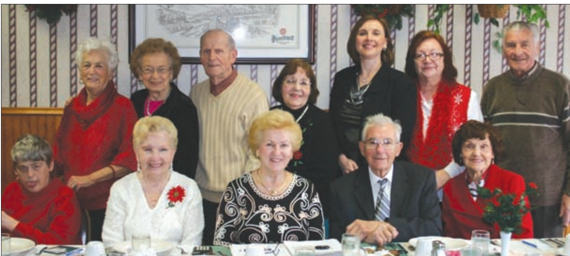
Slavija Lodge 1 officers are preparing for a busy calendar of events in 2012.

We hope it was a very merry Christmas for all!