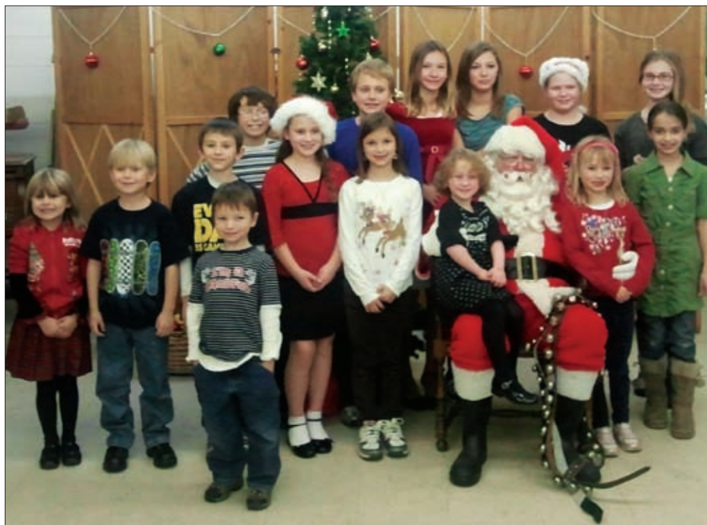
Santa always pays a visit to the Milwaukee youth Christmas party, hosted by Badger Lodge 584, making it a much-anticipated annual event.