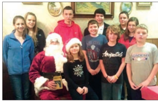
Santa stopped by the Utopians Lodge holiday party for an after-dinner visit with youth members.