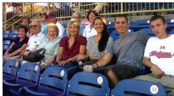
In July, Utopians Lodge 604 members headed to Captains Stadium for Slovenian Heritage Night.

great-granddaughter threw out the first pitch of the game. It was a beautiful, warm evening and very enjoyable.