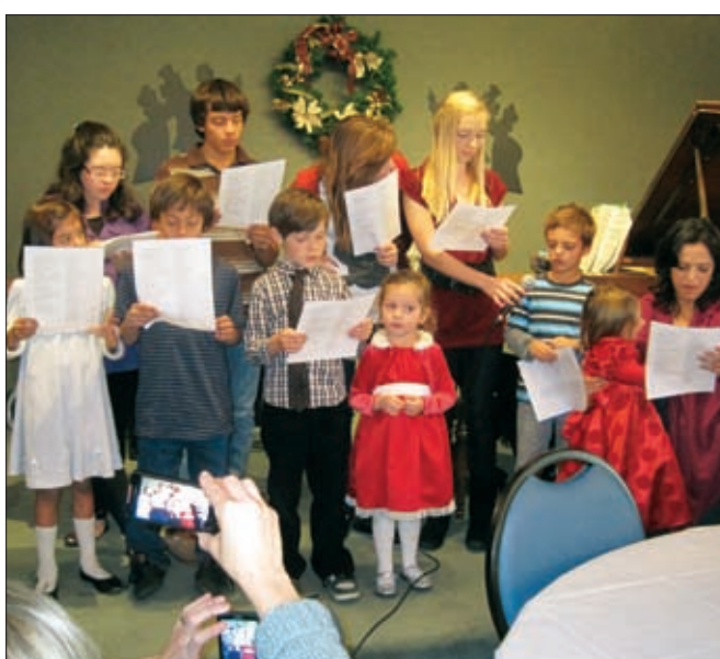
Lodge 786 youth members performed a variety of traditional Christmas carols, prompting Santa to stop by for a visit.