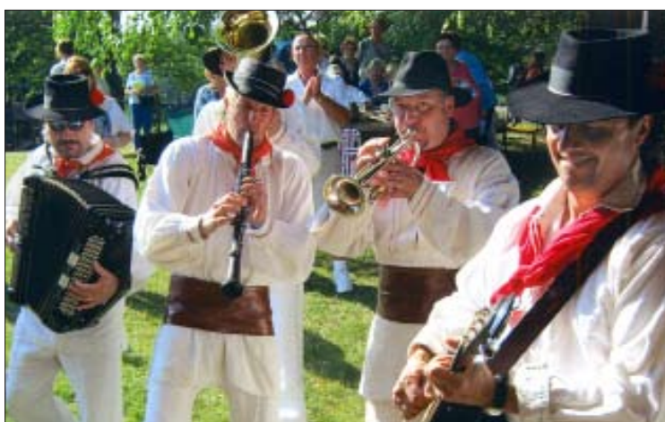
ANSAMBLE DVOJČKI was among the groups entertaining during Slovenefest XXIX weekend.