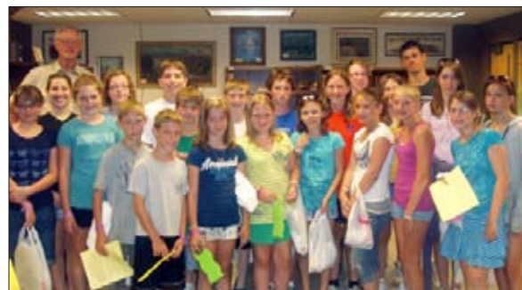
The campers at Youth Roundup enjoyed their time touring the SNPJ Slovenian Heritage Center.

This article winds down my reign as Miss SNPJ 2010. The past year has introduced me to hundreds of people across the United States and has given me opportunities that I will cherish my entire life. Thank you to the SNPJ Executive Committee, the SNPJ Home Office staff for all their support, to the bands, Lodges, hosts/hostesses for inviting me to your functions and making me feel welcome, and especially to my family. Even though my reign has ended, our friendships haven't. I look forward to seeing you at an SNPJ function in the near future and at Slovenefest XXX!