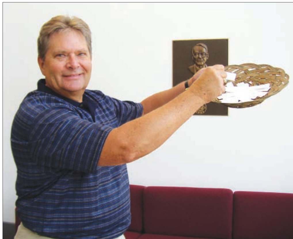
The Luck of the Draw...

You don't want to miss this "fun-tastic" night, so phone the SNPJ Recreation Center toll-free at 1-877-767-5732 to purchase your ticket. This could be one lucky night for you!