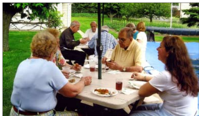
The members of Warren, Ohio, Lodge 321 enjoyed a summer picnic at the conclusion of a recent Lodge meeting.