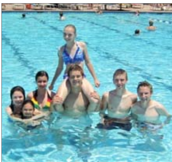
[Below] Orange Coast Lodge 786 youth members and friends cool off in the swimming pool at Rancho Niguel.