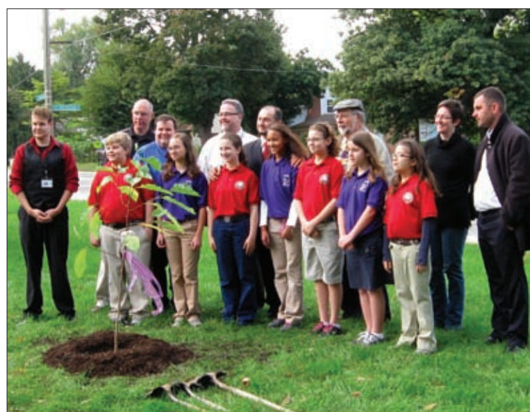
A tree-planting ceremony was held in Indianapolis to mark the 10th anniversary of the Indianapolis-Piran Sister Cities relationship.

a proposed academic exchange between University of Primorska, and Indiana University and Purdue University for the fall 2012 semester.