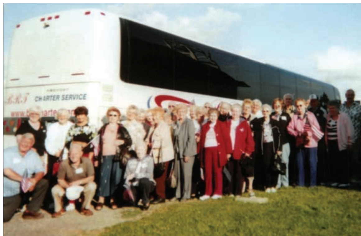
V-Boj Lodge 53 members and friends took part in a bus trip to the Que Creek Mine and Shanksville, Pa., 9/11 crash site in June.