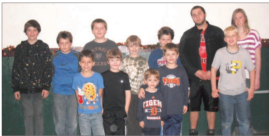
In celebration of the Christmas holiday, Young Americans Lodge 564 and Youth Circle 29 members spent a fun afternoon bowling.

Happy 2012 to all of our friends in SNPJland!